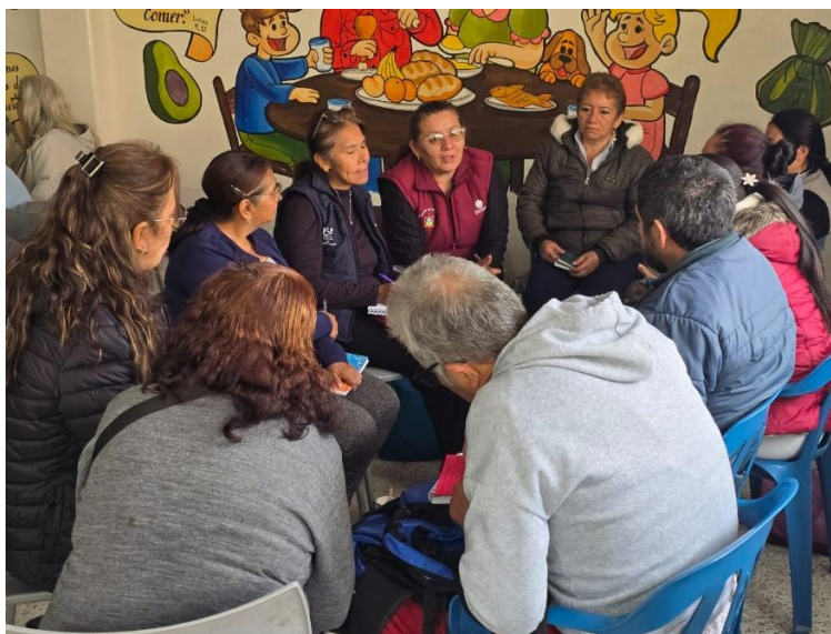
Organizing Takes Flight in Colombia