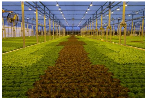
Plants that make up the Gotham Greens Gourmet Medley grow in the Gotham Greens greenhouse in Chicago's Pullman neighborhood.

From local growers who avoided supply chain and transportation troubles that continue to impede large companies importing products from overseas, to the surging popularity of home delivered fruits and vegetables, many Illinois food purveyors say they are surviving, and in some instances, thriving.