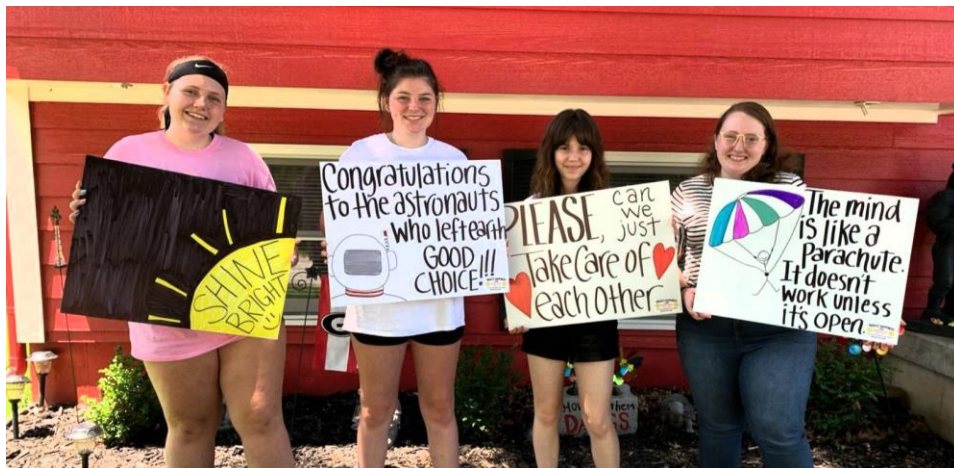
4 LSMO Program Participants